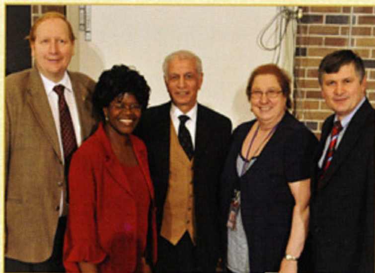
30 years of service