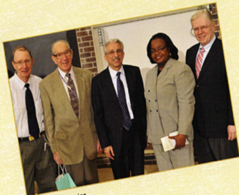
35 years of service